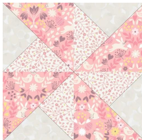
B - 2