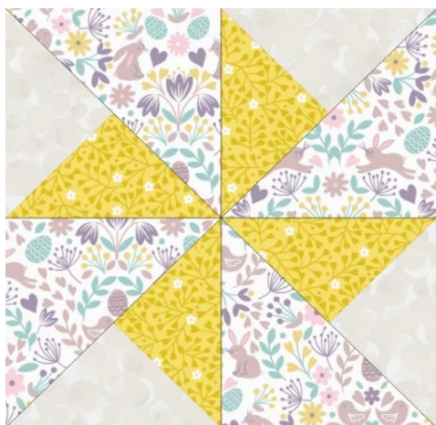
B - 1