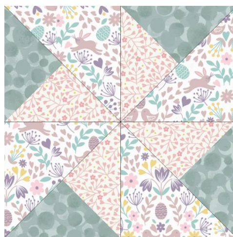
B - 2